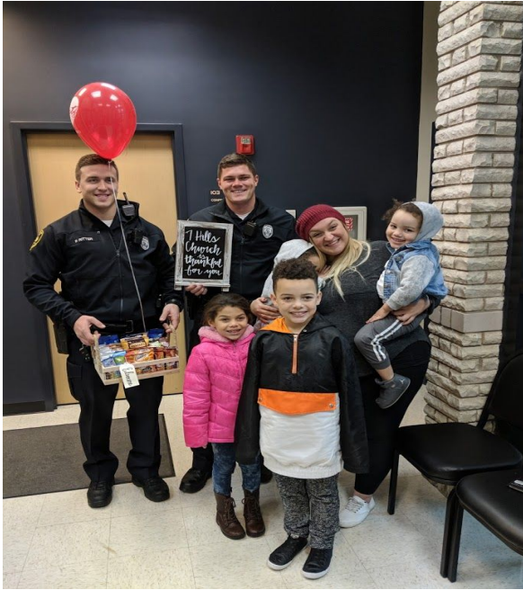
Children from 7 Hills church delivered snacks and thanks to EPD