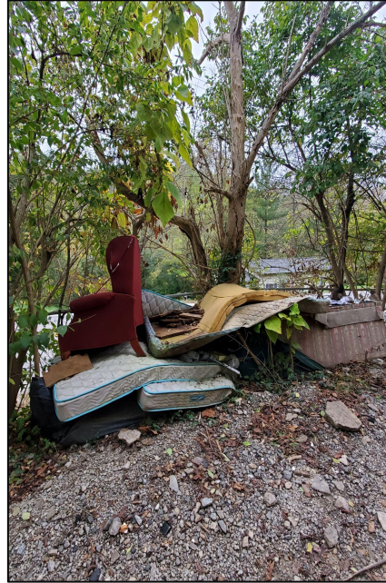
There were 9 reports of Rubbish in the month of November.

While unknown to some, there is a difference between garbage and rubbish. Garbage is generally described as refuse that comes from the bathroom and kitchen. It is basically waste that is organic in nature such as food waste, but can also include clothing, food containers and other types of paper products. Rubbish is considered to be solid material. Old furniture, construction waste, car parts and the like are included in this category. The City's ordinance bans the accumulation of any such waste, be it garbage or rubbish, unless it is enclosed within an authorized covered municipal solid waste container. Mattresses, box springs, and old furniture must be wrapped in plastic; and the homeowner must contact the City's designated trash collection provider to inform them that these items have been placed out for pick up.