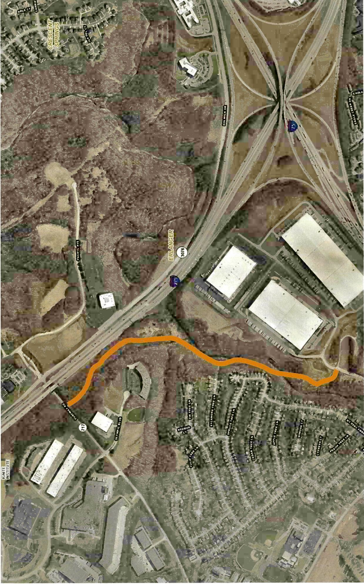
Sycamore Tree Lane Asphalt Seal Coat and Crack Seal Approximately 11,500 SQ Yards